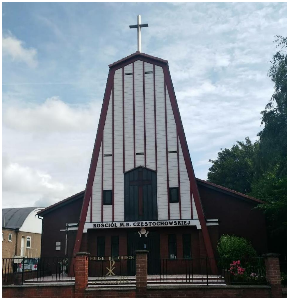
Polish Catholic Church of Our Lady of Czestochowa 2 Sherwood Rise, Nottingham NG7 6JN